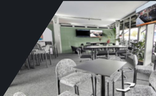
Level 1 Double Bay with upgraded furniture and branding

Options starting at: 30 guests up to 300 guests