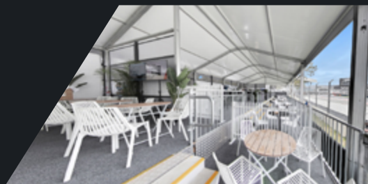
Single bay open air with standard package inclusions

Options starting at: 25 guests up to 200 guests