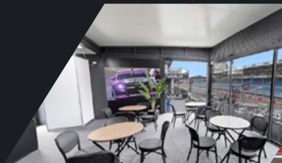
Level 2 Double Bay with standard package inclusions and some branding

Options starting at: 30 guests up to 200 guests